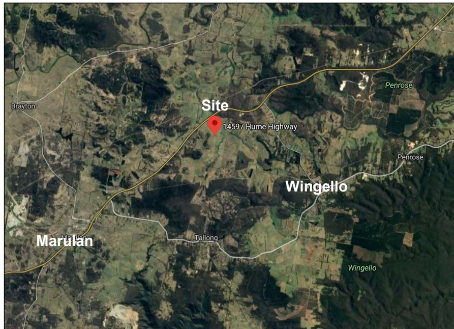
Figure 1: Site Map

The site (known as 'Wingello Park') is located at No. 14597 Hume Highway, Marulan, approximately 7km north-west of Wingello and 14km north-east of Marulan in the Goulburn Mulwaree local government area ( Figure 1 ).